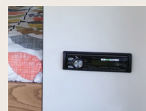
Radio / CD / Auxilliary Player Head with stereo speakers