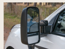
Clearview extendable and foldable power mirrors