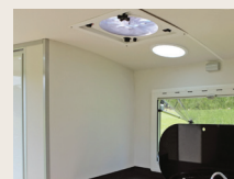
Galley 12V ventilation fan